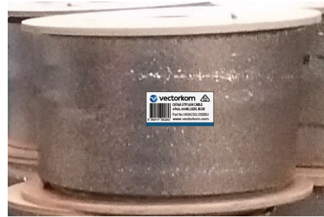
Standard 500M package