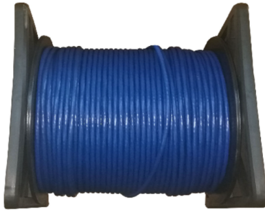
Standard 305M package